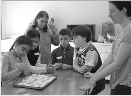
For snack, the older class baked Civil War-era hard-tack, a hearty biscuit that traveled well.